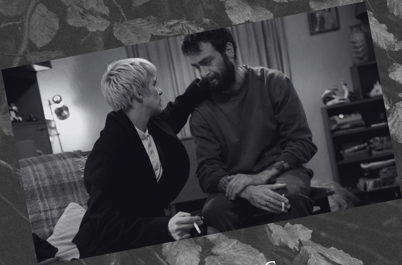
THIS IS ENGLAND